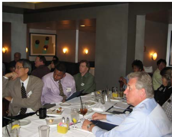
A thought provoking topic.